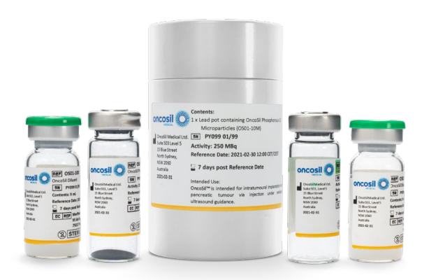
Figure 2: The OncoSil<sup>™</sup> Calibration System

Contents: 1 sealed can encasing 1 x vial of the Microparticles containing 250 ±10% MBq (6.76 mCi) at 12:00 CET (CEST) on the reference date. The vial is supplied inside a Perspex lined lead pot, 2 vials of approximately 9 mL of OncoSil Diluent, 1 empty sterilised P6 vial for dilution of suspension of OncoSil™ (identified with a green stripe on the top of the label), 1 empty lead pot for dilution of suspension of OncoSil™ (identified with a green stripe on the top of the label).